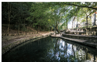
7 #no5hotspringsupplyfacility Surrounded by a peaceful atmosphere

Ehime Prefecture Evacuation Support App "Hime Shelter"