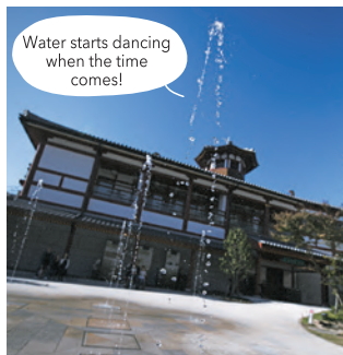
3 #asukanoyu A water fountain show you can see in the inner courtyard