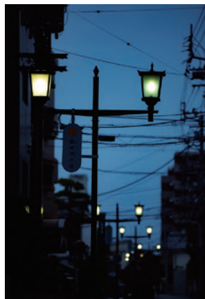
2 #nikitatsunomichi Passing by a beauty parlor and produce shop, the night has a sense of the everyday life and conjures nostalgia