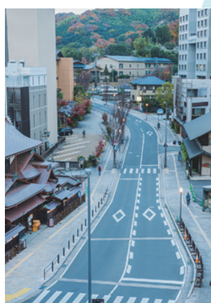
3 #shirasagizakaslope The area is lined with hot spring inns and hotels