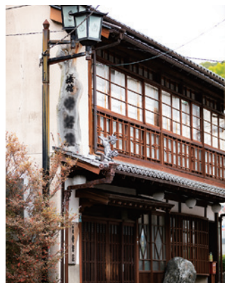
#ryokan #uchiyo (Tokiwasō)

Uchiyo is a hot spring bath at an inn in a hot spring district. In Dōgo, the first uchiyo was made in 1956