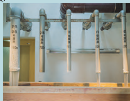
1 No.4 Hot Spring Supply Facility

Water is pumped from 18 hot spring sources of varying temperatures, collected and blended at four hot spring supply facilities, and after the temperature is adjusted, sent to public bathhouses and hotels. It is natural hot spring water to which no heat or water has been added. Guests can enjoy fresh hot water that comes directly from the spring.