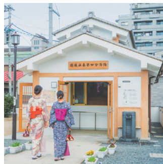
1 #no4hotspringsupplyfacility You can see hot spring water being collected from wells