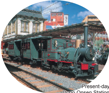
Present-day Dogo Onsen Station

The train used to clatter around the city with Shiki, Soseki and many other people on board. The Botchan train was a favorite sight on the Matsuyama Plain from the old Meiji period to the middle of the Showa era. It has just been brought back to life in this 21st-century castle town.