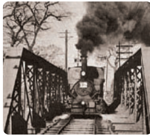
The Botchan train crossing the Ishitegawa railroad bridge on the Yokogawara Line around 1953.