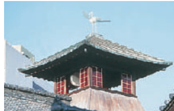
Shinro-kaku Important cultural property