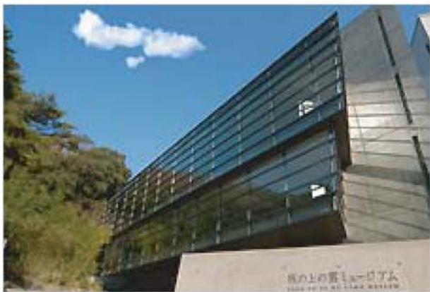
Exterior view (Design: Tadao Ando)