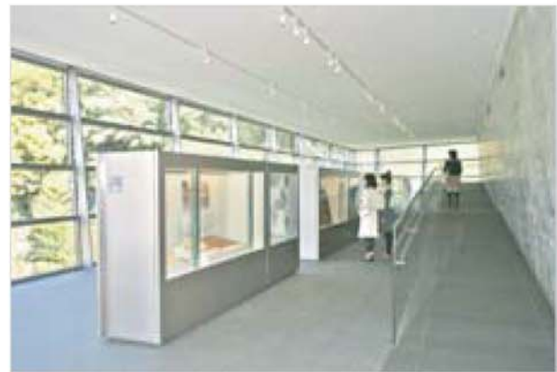
3rd floor Exhibition Room 1